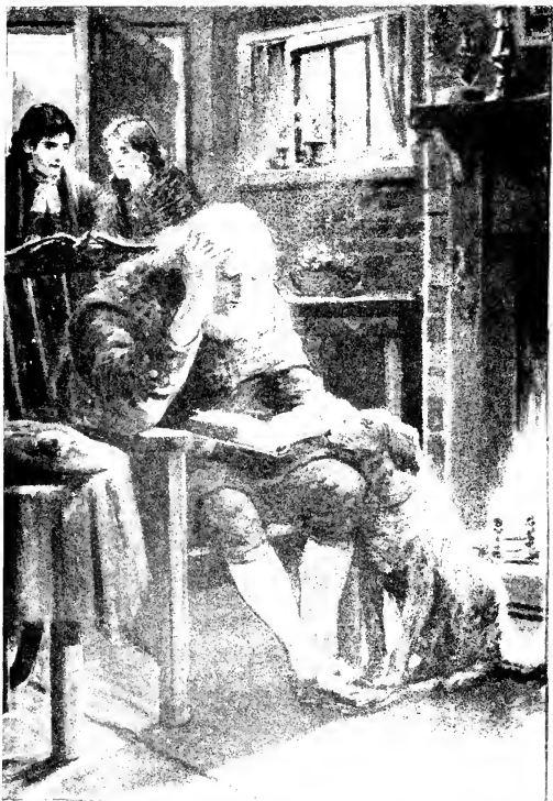
117 "The old man was seated by the fire" 1910